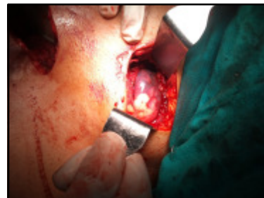
Fig 2. Operative Findings were Herniated Right Upper Lobe through the Fractured Ribs Anteriorly in the Region of 4-6th Intercostals Space

Lung herniation is uncommon and has been defined as the protrusion of pulmonary tissue and pleural membranes through defects of the thoracic wall, (1) which may be congenital, spontaneous, or pathologic or may be the result of thoracic wall trauma (2). The majority of acquired pulmonary hernias are of traumatic origin (3,1,4). Hernias caused by blunt chest trauma more frequently arise anteriorly near the sternum or posteriorly, where there is only one intercostal muscle layer, and they usually protrude between rib spaces (5, 3,6,7). Intercostal lung hernias usually protrude through thoracic wall defects caused by costal or sternal fractures or associated rib-chondral separation (1,7,8). Supraclavicular pulmonary herniations occur as a result of clavicle-sternal dislocation (1,5). Most spontaneous lung hernias are associated with conditions of prolonged or excessive increase in intrathoracic pressure and have a predilection for areas of potential weakness in the chest wall (3,7). These areas