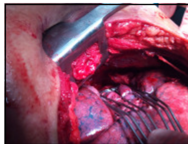
Fig 3. Showing Herniated Lung Being Reduced

occur anteriorly from the costochondral junction to the sternum because of the absence of external intercostal muscles (3,7,8) The anterior thorax is the site of predilection for both spontaneous and traumatic lung herniations, presumably because the anterior thorax lacks the muscular support afforded the posterior thoracic wall by the trapezius, latissimus dorsi, and rhomboid muscles (6,8). Most patients with lung hernias are asymptomatic. The usual sign is a bulging mass in the chest wall or neck associated with coughing, straining, or lifting. A soft, smooth, reducible mass that changes in size with respiration, protruding through a palpable defect in the chest wall, is usually evident on examination (3,7,8). Posttraumatic lung herniation can be visualized on chest radiographs as a well-circumscribed area of subcutaneous air, although tangential views may be necessary in some patients, such as the one in this report (2,7). CT provides valuable information regarding the thoracic wall and pleural space and better defines the dimensions of the hernia. The more liberal use of CT may expand the number of diagnoses. Early surgical repair offers the best