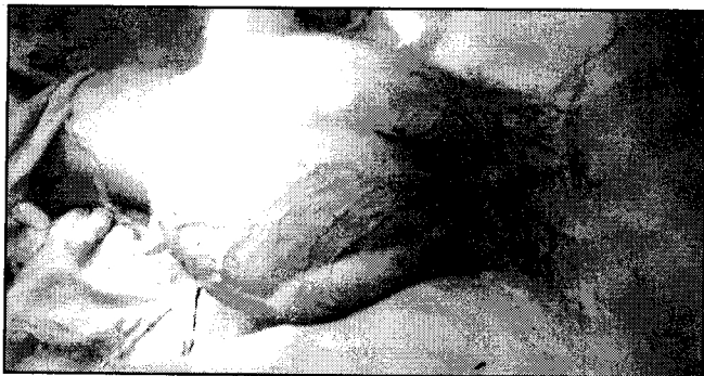
Fig.1 Showing giant right inguino-scrotal hernia.