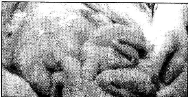
Fig. 3 Showing hernial contents including terminal ileum, appendix, caecum and ascending colon.