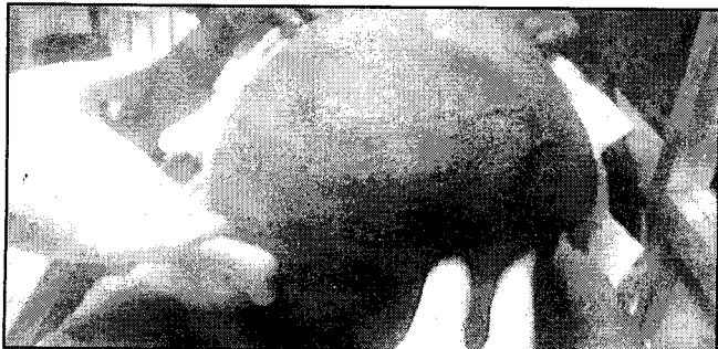
Fig. 2 Showing giant right inguino-scrotal hernia.