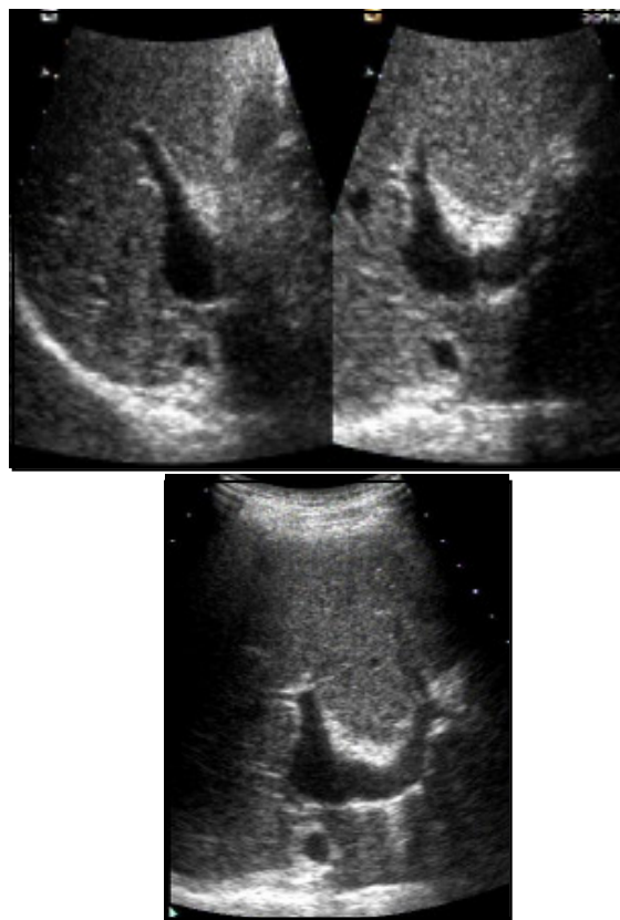
Fig. 1 & 2 The B- mode Images Reveal Focal Dilatation of Intrahepatic Portal Vein

From the Deptt. of Imaging Saifee Hospital, Maharshi Karve Marg, Mumbai - India