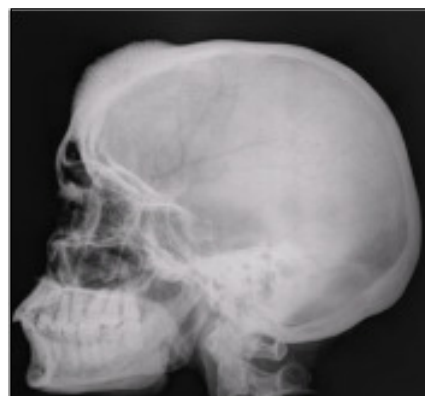
Fig 1. X ray Skull Lateral View showing "Hair on End" Appearance