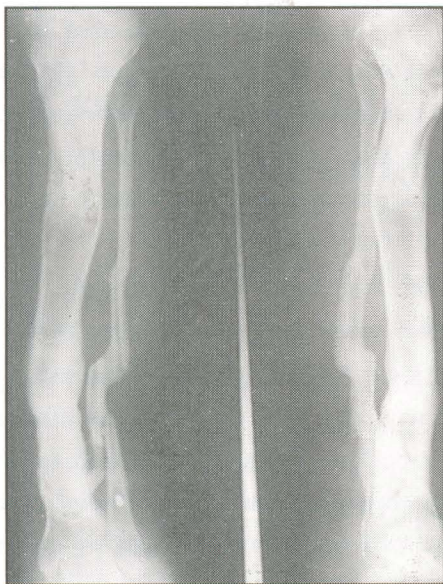
Fig 3. Showing mature regenerate & union at the time of removal of the fixator.