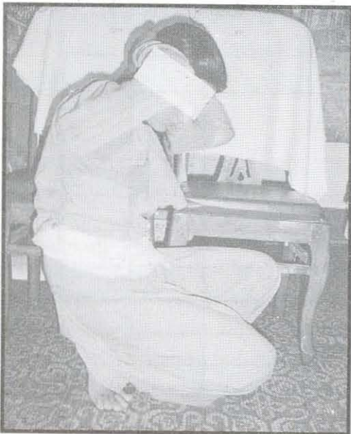
Fig 2: Photograph showing difficulty in squatting due to restriction of flexion and adduction of both hip joints.